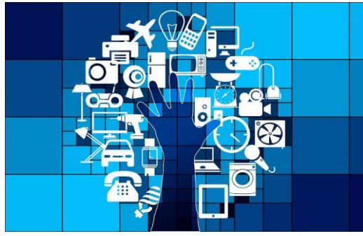
Fig. 1. Internet Media

Today is the world of internet and Digital Media. Most of the data is preserved in form of digital medium and transmitted through Internet all over the world. This is one of the most economic medium of promotion and advertising business in the world of today as most of the people of our country, India, are accessible to smartphone and internet. Business from product to service are all processed through digital medium.