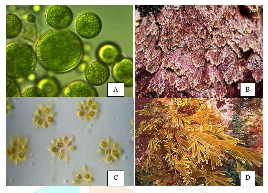
Fig 2: (A) Green algae (B) Red algae (C) Golden algae (D) Brown algae