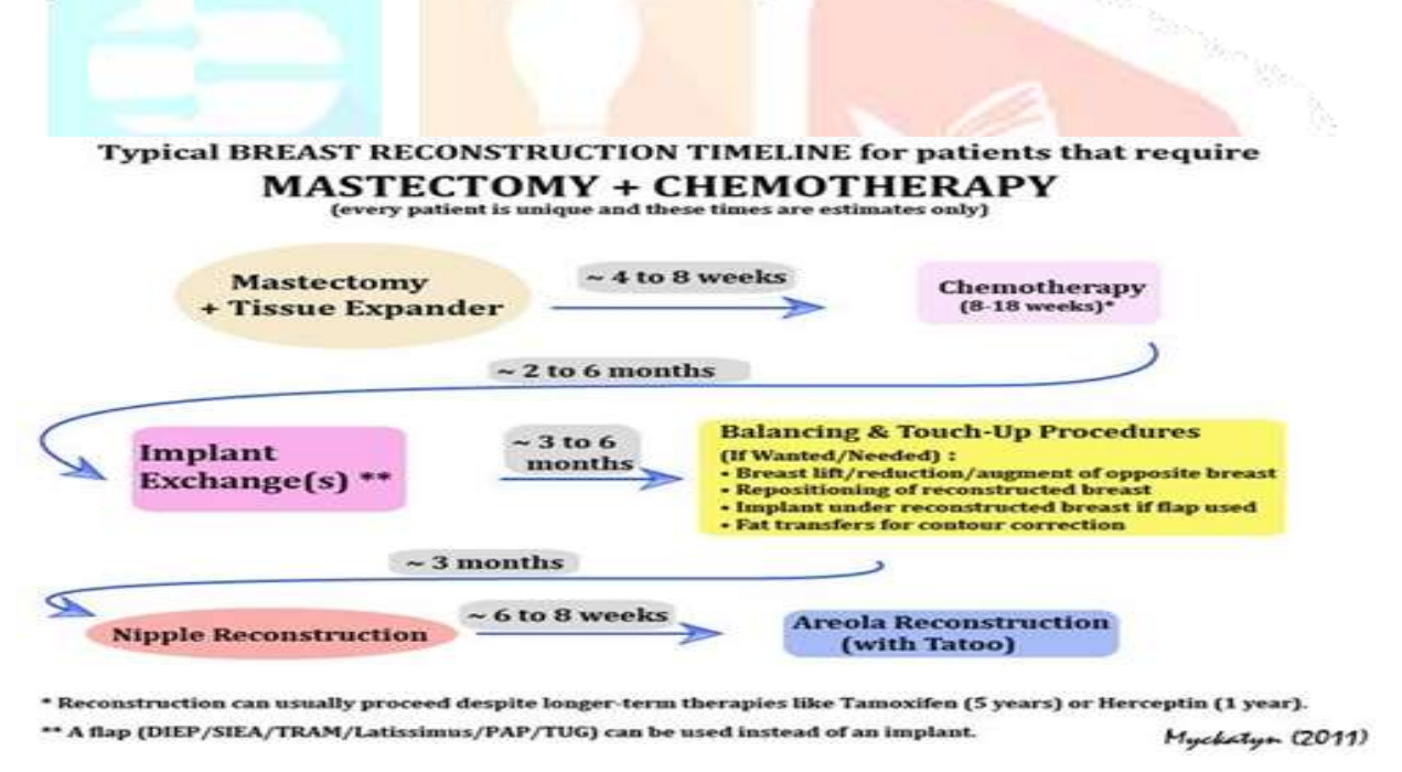
Figure: F2 Typical Brest Reconstruction Timeline for Chemotherapy

Chemotherapy can affect reconstruction in several ways. Some forms of chemotherapy may delay wound healing, increase the risk of surgical infection, or cause you not to feel well, thus altering the timing of a reconstruction. Some forms of chemotherapy like Herceptin can temporarily affect heart function, and you may need to wait to recover from this therapy before reconstruction can be completed.