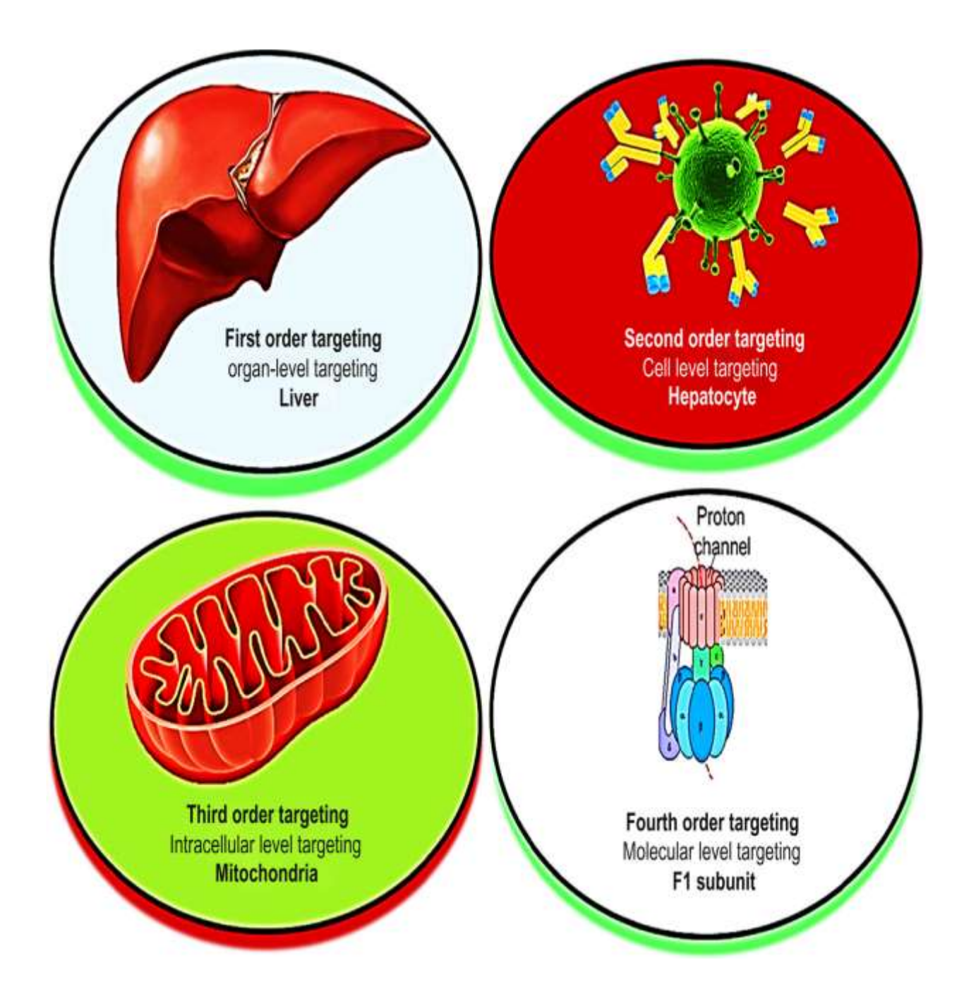
FIGURE 2.4 Levels of drug targeting. Illustration showing different levels of targeting possible in liver. Targeting the liver directly is organ targeting; the liver contains hepatocyte cells, which are involved in cellular targeting. Within the hepatocyte are mitochondria, which are targeted in intracellular or organelle targeting, and finally, the F1 subunit part of mitochondria is involved in molecular-level targeting.

based mostly substance mediate entry of a drug advanced into a cell by endocytosis [15]. Active targeting are often delineated at four levels as shown in fig ;-