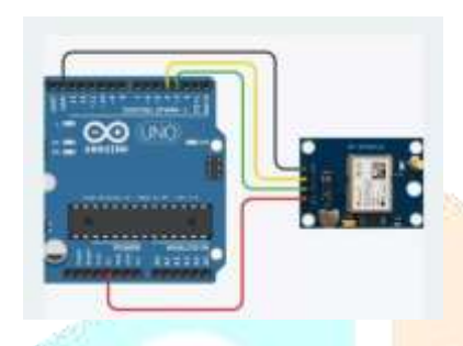
Fig.3.GPS6MV2 interface with Arduino UNO

used to calculate the location of the receiver. GPS recipient gets messages from satellites and that is used to choose the satellite positions and time sent. GPS satellites circle the Earth two times per day in an exact circle. Each satellite transmits a one of a kind sign and orbital parameters that permit GPS gadgets to disentangle and process the exact area of the satellite. GPS collectors utilize this data and trilateration to ascertain a client's accurate area. Basically, the GPS recipient gauges the separation to each satellite by the measure of time it takes to get a transmitted sign. With separation estimations from a couple of more satellites, the recipient can decide a client's position and show it. Fig.2 shows the GPS module used. Fig.4.3shows the GPS interface with Arduino.