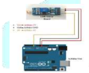
interface with Arduino

LDR: A light reliant resistor chips away at the standard of photograph conductivity. Photograph conductivity is an optical marvel where the materials conductivity is expanded when light is consumed by the material. At the point when light falls for example at the point when the photons fall on the gadget, the electrons in the valence band of the semiconductor material are eager to the conduction band. These photons in the episode light ought to have vitality more noteworthy than the band hole of the semiconductor material tomake the electrons hop from the valence band to the conduction band. Consequently when light having enough vitality strikes on the gadget, an ever increasing number of electrons are eager to the conduction band which results in Fig.6. LDR module