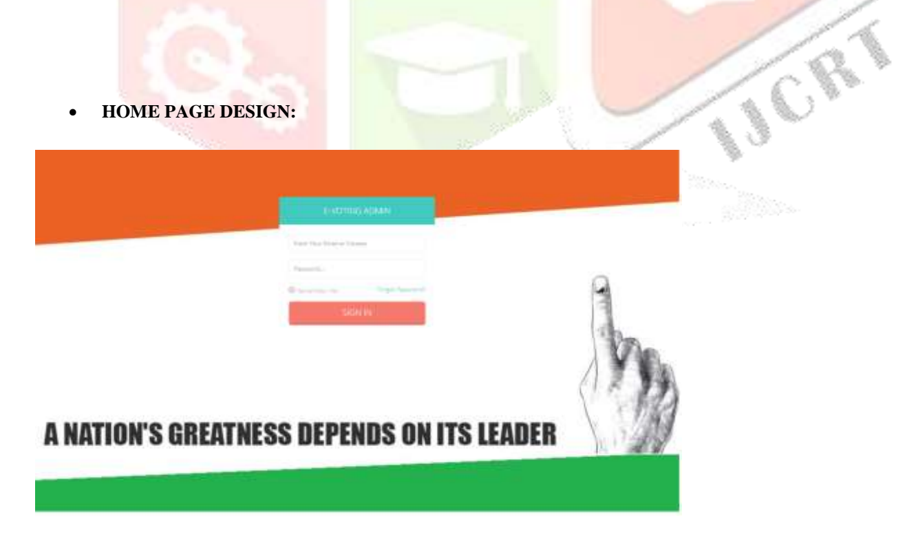
Fig. HOME PAGE

The system resides the new concept of QR code and scanner application. The user should download the e-voting application then perform registration and login process. After the process is completed the admin accept or reject the voter based on their voter details. The QR code will be generated for the voter then scan the QR code through the mobile scanner application. In the scanning process the voter will be authenticated. Then perform voting the server producing a result to the voter.