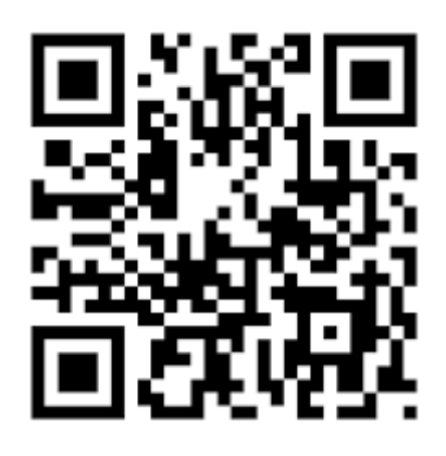
Fig. QR CODE

QR Code QR code (abbreviated from Quick Response Code) is the trademark for a type of matrix barcode (or two-dimensional barcode) first designed for the automotive industry in Japan. A barcode is a machine-readable optical label that contains information about the item to which it is attached. A QR code uses four standardized encoding modes (numeric, alphanumeric, byte / binary, and kanji) to efficiently store data extensions may also be used. The QR Code system has become popular outside the automotive industry due to its fast readability and greater storage capacity compared to standard UPC barcode. Applications include product tracking, item identification, time tracking, document management, general marketing, and much more.