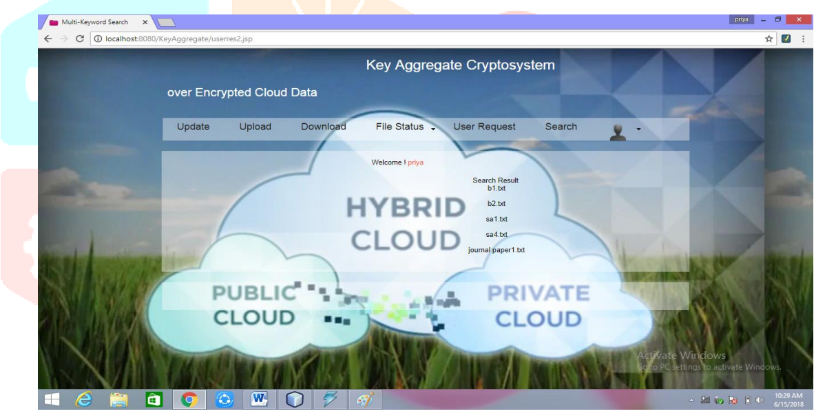
Fig.4. Multi-keyword search

Fig.4 shows the search operation executed at the cloud server side comprises of registering the internal item count for all the files in the dataset. The file set or archive list while the quantity of keyword in the query enter by client. This is natural in light of the fact that the inquiry procedure needs to go over all the files in the dataset before the cloud server can get the final result. The inward item calculation is just identified with the length of the list, so the calculation time changes.