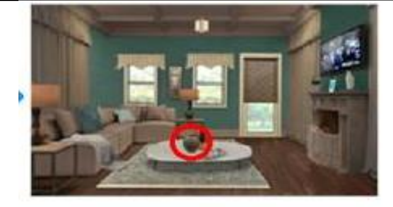
Fig 4.3 3D password