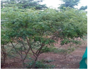
Figure.13, the growth of the plant using the organic fertilizer.