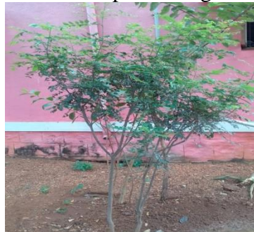
Figure.14, the growth of the plant without using a fertilizer. REFERENCES

Figure.13, the growth of the plant using the organic fertilizer.