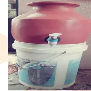
Figure.4 A pot selected for composting Put all your kitchen waste for the day over this soil as shown in figure.5 and figure.6.

Figure.3 A pot with first layer coconut husk and soil.