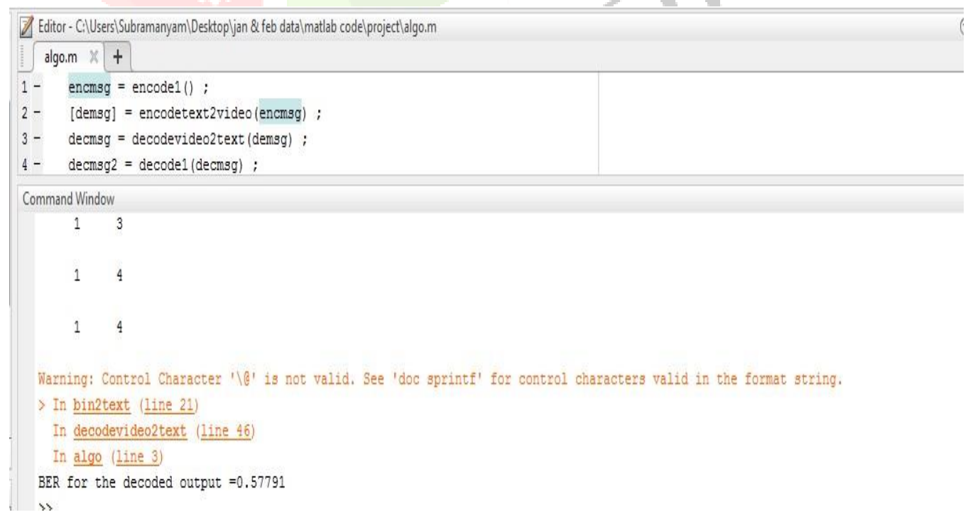
Fig3: BER Result

The above shown figure 2 is the retrieved text after the execution we will get the same input data as output but in place of space we get the alphabet MJ and in place of full stop we get n. This is the retrieve text what we get as an output. This retrieved text is the data which we extract from the stegovideo.