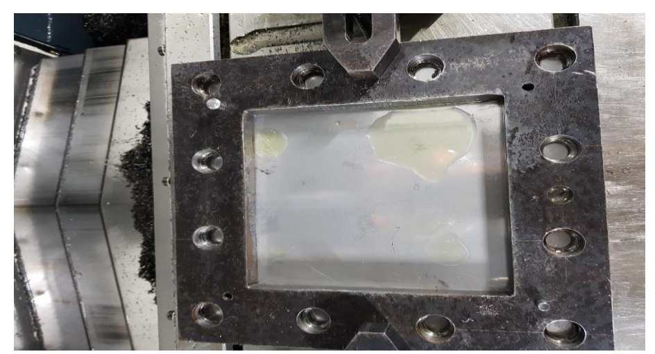
Figure: sheet metal set up