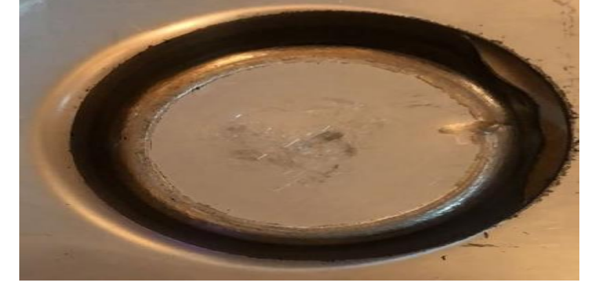
Figure – wall angle 60 degree