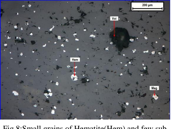
Fig.8; Small grains of Hematite(Hem) and few sub to anhedral Magnetite (Mag) grains. [X-100].