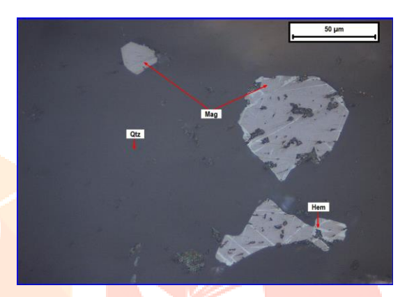
Fig. 10;Irregular shaped altering Magnetite(Mag) and un altered Hematite(Hem). (X-100)