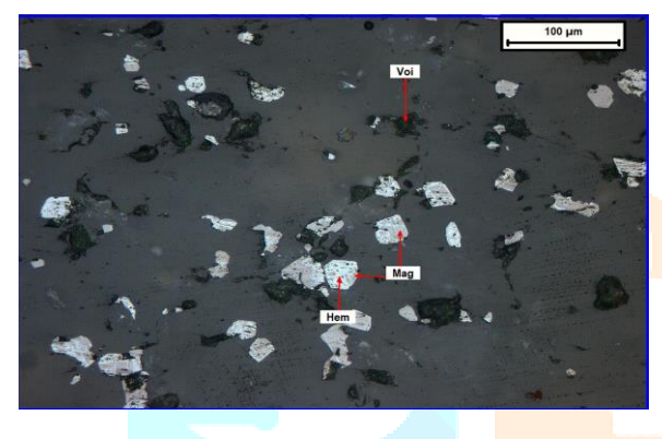
Fig.9; Association of medium size grain of Magnetite(Mag) and un altered Hematite(Hem)(X-200).