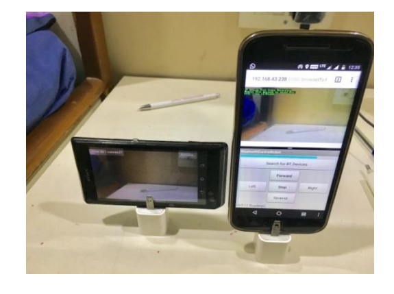
Fig: Phone to Phone Monitoring

At the receiver end, these commands are used for controlling the robot in all directions such as forward, backward and left or right and capture the video and transmit to android device at the receiving end the movement is achieved by two motors that is interfaced to the Arduino. Serial communication data sent from the android application is received by a wireless receiver interfaced to the Arduino. The program on the Arduino refers to the serial data to generate respective output based on the input data to operate the motors through a motor driver IC. The motors are interfaced to the control unit through motor driver IC.