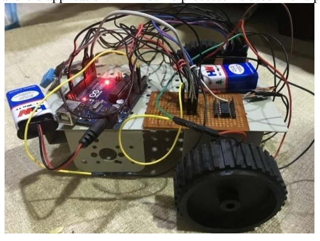
Fig: Vehicle Robot

The project is designed to control a robotic vehicle using an android application. Wireless device is interfaced the control unit on the robot for sensing the signals transmitted by the android application. An Arduino processor is used in this project as control device.