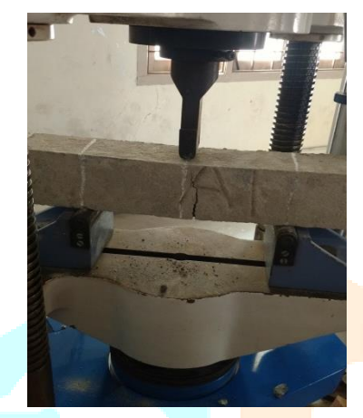
Compression test of a cube