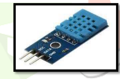
Fig.2 Temperature and Humidity Sensor

It is a coordinated circuit sensor that can be utilized to gauge the temperature in the nursery. It gauges and shows the temperature values intermittently. Humidity sensor is utilized for detecting the vapors as a part of the air. The adjustment in RH (Relative Humidity) of the environment would bring about show of qualities.DHT11 and voltage is +5V.It has been taking the input Temperature and Humidity in surroundings and produce a output in the for of Digital signal using the units Temperature in Celsius and Humidity in percentage is shown in the Fig.2