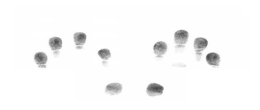
Figure 2. Acquired fingerprint images

The input images are enhanced for further feature extraction. The fingerprint image capture is a bit tedious job because the baby is not always ready, he/she might be sleeping, crying etc. And parents concern is also very important factor.