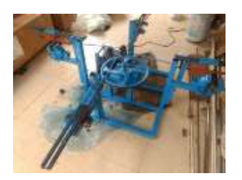
Fig. 7 Final project

For one piece Cutting Cost = 8/4 = 2Rs Per Piece