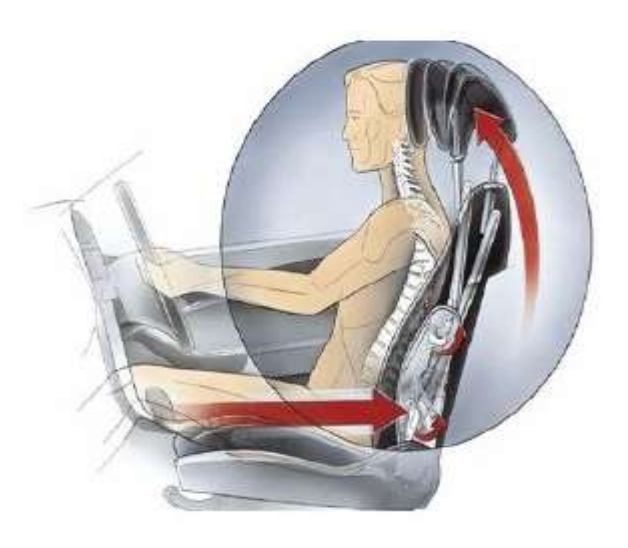
Fig-4 Pro active Head Restraint