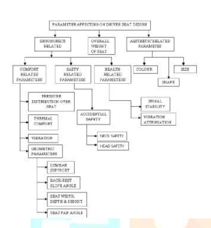
Fig-2: Classification of Parameters Affecting Design of Driver Seat

2.2.2 Other Adjustments It includes other parameters apart from lumbar support. Seat adjustments totally depend on driver body shape and size i.e. anthropometry. Therefore seat designer must study the huge amount of data related to anthropometry before building a first prototype. Seat angle is also responsible for pressure distribution over seat. Seat pan can be tilted in between 0-100 angle depending on driver body shapes and sizes.