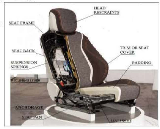
Fig-1: Cut section of driver seat components and systems

Driver seat is very complicated, consists of large number of parts and mechanisms. Main parts of driver seat are frame, padding, seat pan, head restraints system, reclining mechanism with lever, trim (seat cover), and suspension system, air bags, seat belt, fore and aft adjustment, height adjustment etc.