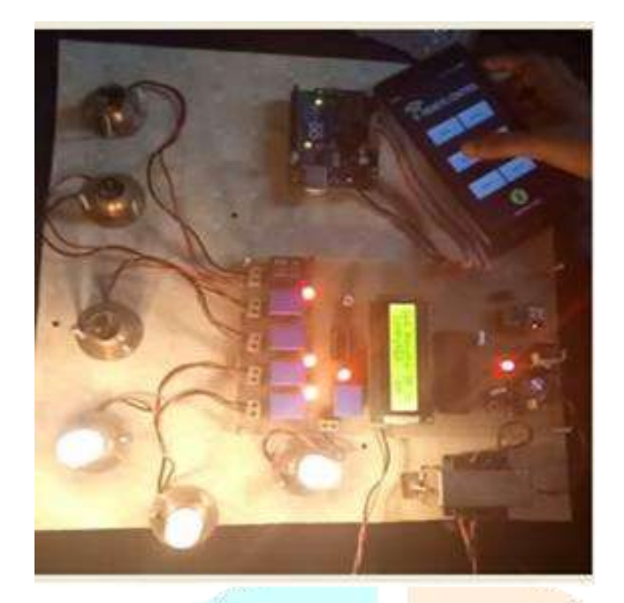
Fig3.Showing system hardware implementation.

Fig. shows the interfacing of microcontroller with WiFi module. Microcontroller 8051 is 8bit microcontroller. programming code is written in microcontroller. WiFi module is paired with android application which name is S Remote. As shown in fig on android mobile phone, there is six buttons shows. this six buttons assign for the six load. after the touch button, loads are operated.