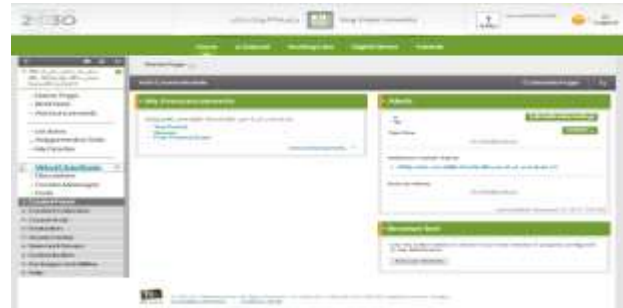
Figure 3: Blackboard

Big data has a great influence in education world. In this paper we are going to discuss about the usage of big data in King Khalid University for E-learning. In King Khalid University most of the courses present online. Application named as Blackboard allows the teacher to post announcements, Lectures and formative assessment through blackboard. Black board is a segment which is designed to store different types of data to have easy access. Figure 3 shows overview of blackboard used in KKU.