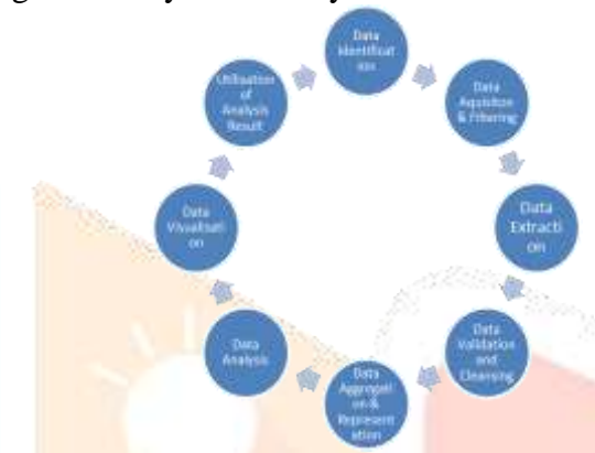
Figure 2:Big Data Life Cycle

As shown in the figure 2, big data analytics Life Cycle describe the following stages [3]: