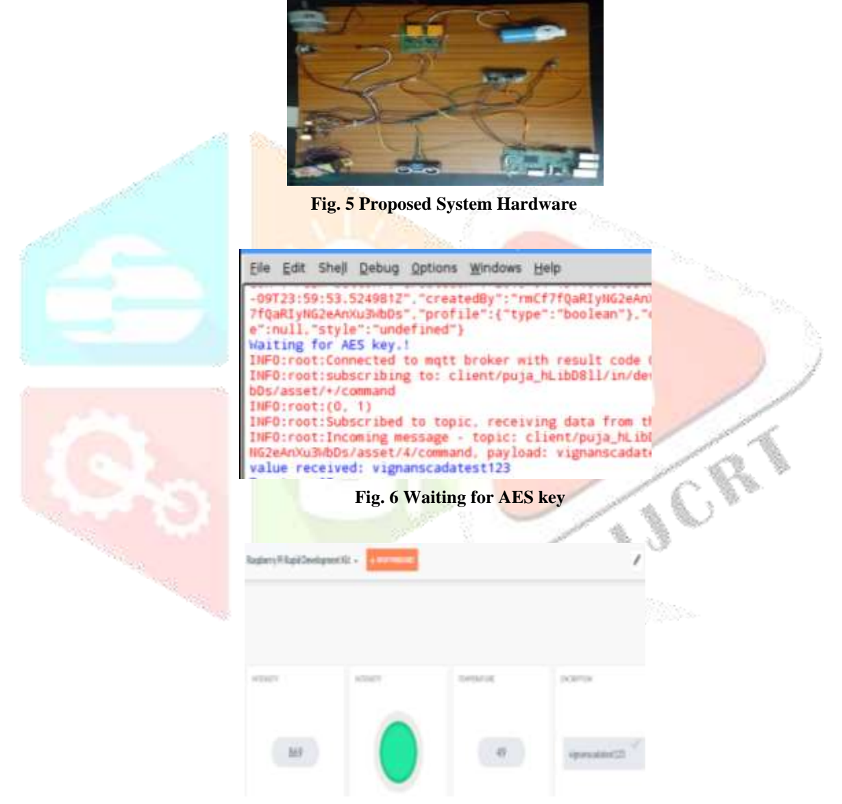
Fig. 7 Output shown in IOT