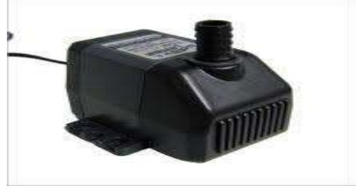
Figure 3:- Submersible pump