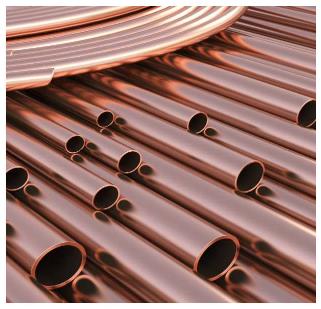
Figure 2:- Copper tube

Today, copper tube for the plumbing, heating and air-conditioning industries is available in drawn and annealed tempers (referred to in the trades as "hard" and "soft") and in a wide range of diameters and wall thicknesses. Readily available fittings serve every design application. Joints are simple, reliable and economical to make—additional reasons form selecting copper tube today, nearly 5,000 years after Cheops, copper developments continue as the industry pioneers broader uses for copper tube in engineered plumbing systems for new and retrofitted residential, industrial and commercial installations.