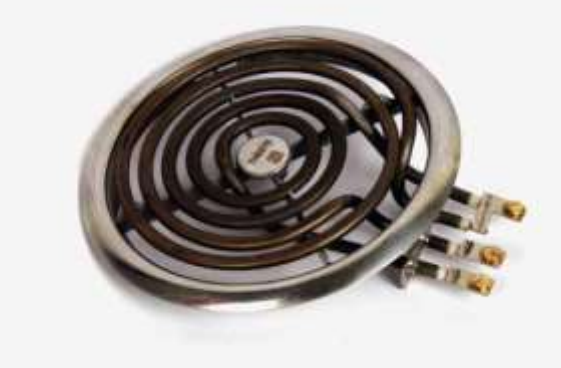
Figure 3:- Heating Coil

Nickel is a high-density, high-strength metal with good ductility and excellent corrosion resistance and high temperature properties. Ni has may unique properties including its excellent catalytic property. Nickel Catalyst for Fuel Cells. Nickel cobalt is seen as a low-cost substitute for platinum catalysts. Two-thirds of all nickel produced goes into stainless steel production. Also used extensively in electroplating various parts in variety of applications.Ni-base super alloys are a unique class of materials having exceptionally good high temperature strength, creep and oxidation resistance. Used in many high temperature applications like turbine engines.