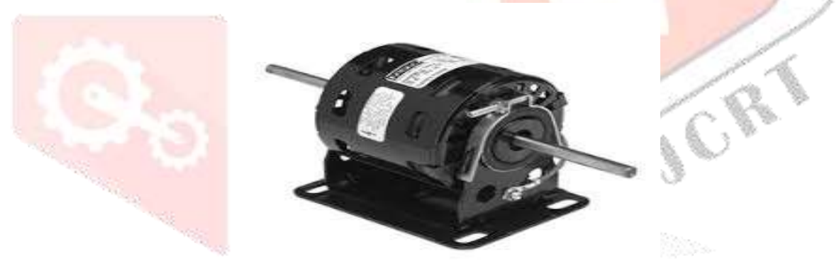
Figure 1:- Double Shaft electric motor

A double shaft electric motor is a device for converting electrical power into mechanical power. An electric motor will try to deliver the required power even at the risk of self-destruction. Therefore, an electric motor must be protected from self-destruction. Motors may be ruined by physical damage to the windings but, usually, the enemy of a motor is excessive heat in the windings. Overheating breaks down the thin varnish like insulation on the windings. When the insulation fails, the motor fails. Overheating is the result of excessive current flow or inadequate ventilation. Accumulation of dust and dirt on and in the motor can reduce ventilation and heat removal.