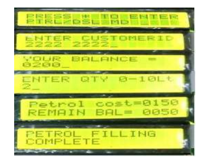
Fig. 4. Complete Filling Process