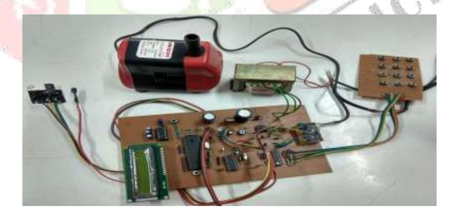
Fig. 3. Complete Experimental Setup

The complete hardware module and power supply unit is shown in figure 3 below. The system operates on very less power supply i.e. from 5V and 12V only which is easily available.