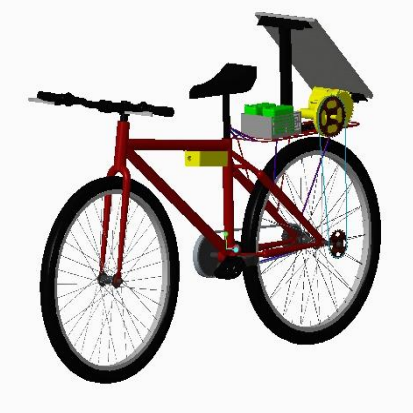
Fig. 2 CREO Design Model of the cycle viewed from left side