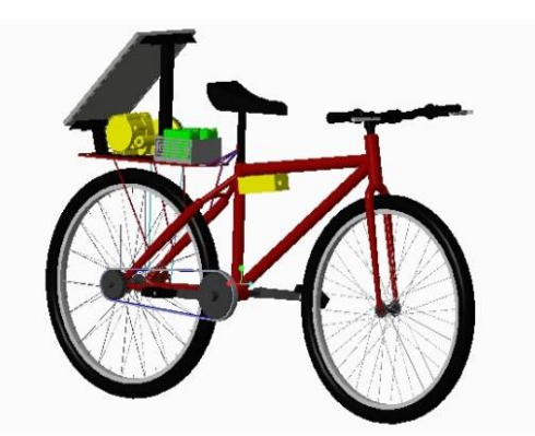
Fig. 1 CREO Design Model of the cycle viewed from right side

We have designed the bicycle by considering all the possible ways through which the rider is able to get maximum flexibility for that we have placed all the mechanism used in the bicycle at the rear end of the bicycle. Moreover, the balancing of the engine mechanism placed at the end and that of the rear wheel have also been considered faultlessly.