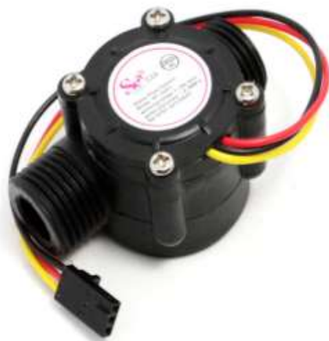
Fig –3 water flow sensor

Water flow sensor consists of a plastic valve body, a water rotor, and a hall-effect sensor. When water flows through the rotor, rotor rolls. Its speed changes with different rate of flow. The hall-effect sensor outputs the corresponding pulse signal. This one is suitable to detect flow in water dispenser or coffee machine.