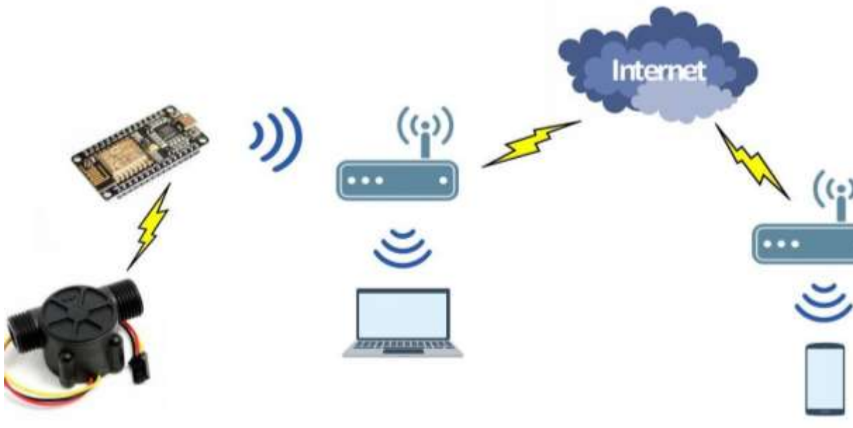
Fig:1 Iot water monitoring system