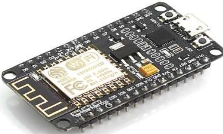
Fig -2 NodeMcu

NodeMCU is an open source IOT platform. It includes firmware which runs on the ESP8266 Wi-Fi SoC from Espressif Systems, and hardware which is based on the ESP-12 module.