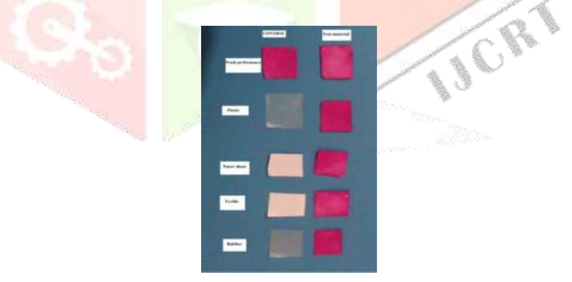
Fig. 4.24 Effect of pigment on various dyed material and wash performance of pigment.

Results clearly indicate that pigment produced by isolate ARITM02 can be effectively used to dye different types of materials like textile material, paper, plastic and rubber. The wash performance suggests that dyed material can be washed at 50°C (Figure 4.24).