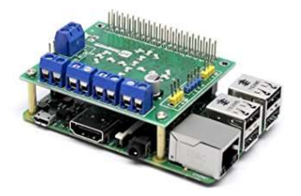
Figure 3: Stepper motor hat for Raspberry Pi

Engines are controlled by TB6612 MOSFET drivers with 1.2A for each channel momentum limit (you can draw in up to 3A peak for around 20ms at any given minute), a noteworthy change over L293D drivers and there is worked in flyback diodes as well. Figure 3 demonstrates a model of the engine cap. The part of stepper engine cap is to secretive the yield signals from Raspberry Pi to electrical shape and create it to the dc engine.