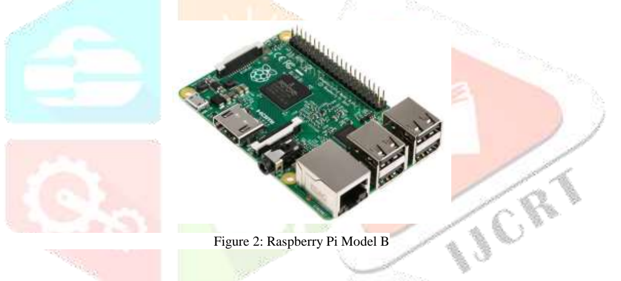
Figure 2 demonstrates a Raspberry Pi Model B. The guidelines from the Android application are gotten through Wi-Fi correspondence and are prepared.

The Raspberry Pi 3 Model B is the most recent form of the Raspberry Pi. Include a console, mouse, show, control supply, miniaturized scale SD card with introduced Linux Distribution for a completely fledged PC that can run applications from word processors and spreadsheets to diversions. It keeps running on 1GB LPDDR2 (900 MHz) RAM and 4 \times ARM Cortex-A53,a 1.2GHz processor with 10/100 Ethernet, 2.4GHz 802.11n remote systems administration capabilities[5].