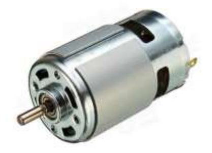
Figure 5 : DC motor

A DC engine is any of a class of rotational electrical machines that proselytes coordinate current electrical vitality into mechanical vitality. The most widely recognized writes depend on the powers created by attractive fields.