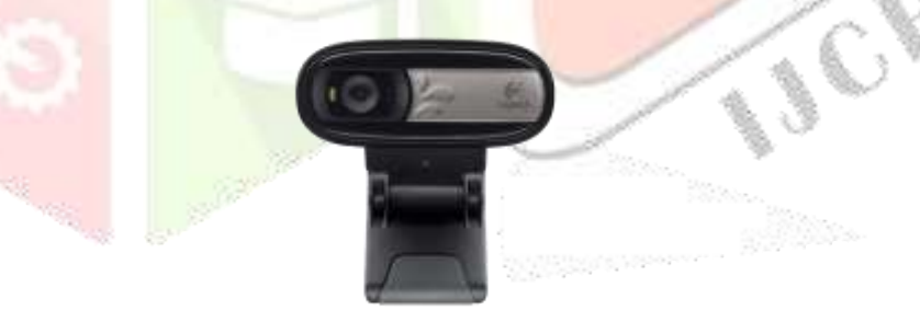
Figure 6 : USB camera

It will be possible to trade live video to the cell phone with the USB Camera joined to the Raspberry Pi 3. The live video transmission closes when the application is ended on the cell phone. The equipment part is executed with the assistance of a structure of a meanderer and the dc engine is joined to its wheels. The stepper engine cap is mounted on the Raspberry Pi. The Raspberry Pi and USB camera are then to the system. The engine cap is associated with dc engines, the USB camera to the Raspberry Pi, sensors to scratch. Figure 6 demonstrates the USB camera.