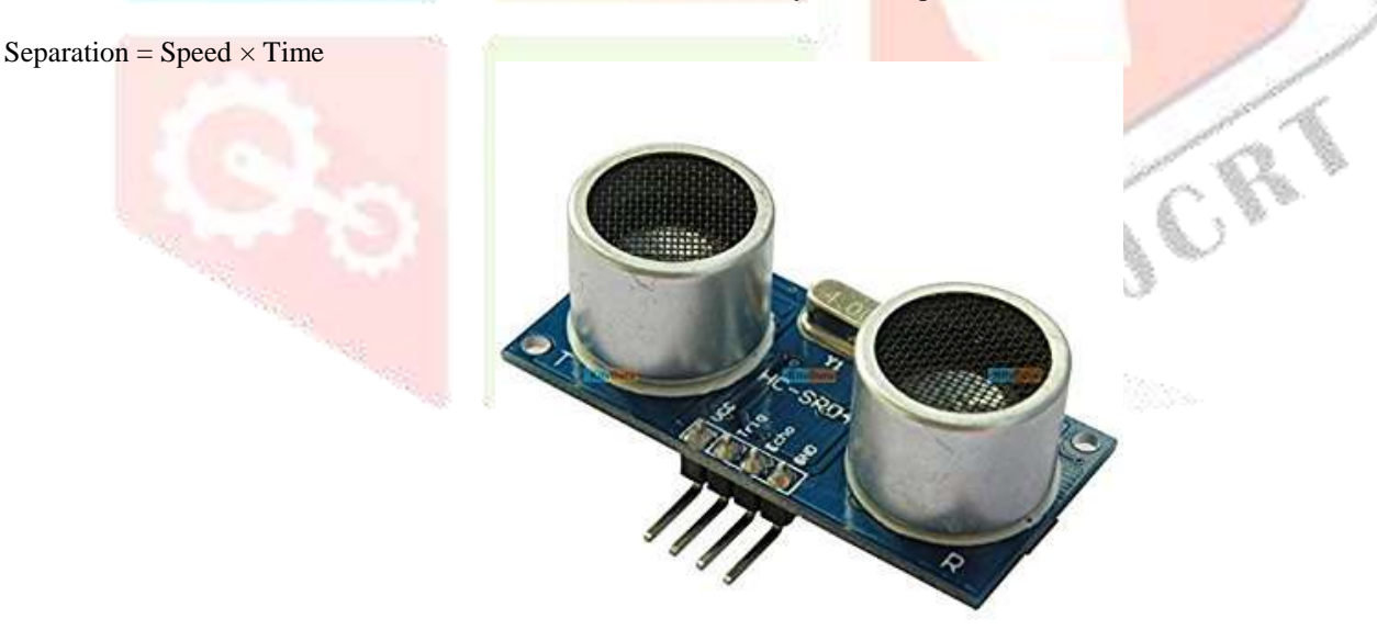
Figure 4: HC-SR04 Ultrasonic sensor

HC-SR04 Ultrasonic (US) sensor is an extremely well known sensor utilized as a part of numerous applications where estimating separation or detecting objects are required [2]. The module has two eyes like activities in the front which shapes the Ultrasonic transmitter and Receiver. The sensor works with the basic secondary school equation that is