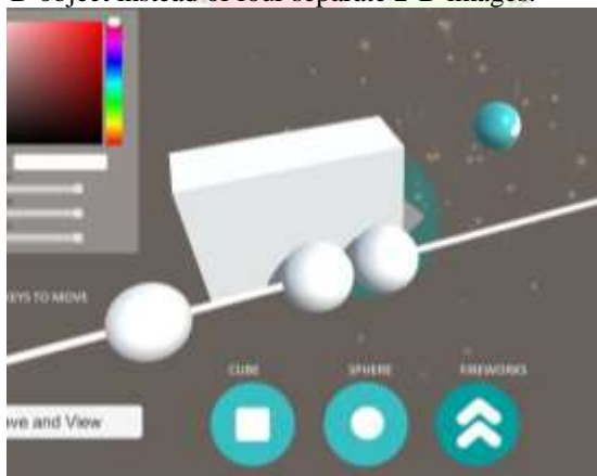
Fig. 3 Creating holographic 3-D objects in Unity3D

Unity3D is used, a game engine used for three-dimensional modelling. The holographic effect is achieved using an imported open source package which means the same script can be applied to one 3-D object instead of four separate 2-D images.