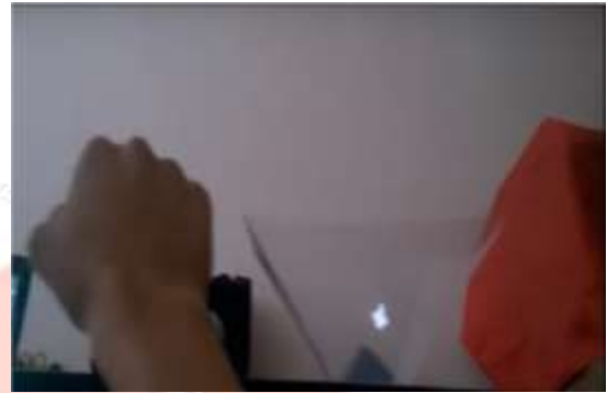
Fig. 4 Interaction done using a marker

Depending on the lighting used and how sensitive the camera is, the smoothness in movements can vary. However, care must be taken that the Pepper's Ghost hologram is displayed in a dark area so the hologram is seen clearly.