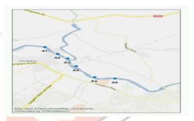
Fig: 4.1 Map Of Locations

Above map shows the various sampling location within the study area for analysis of Godavari river in Nashik city. Main stream sample along the river design by letter A1, A2, A3.... A6. In the study area sample collection carried out following region respectively