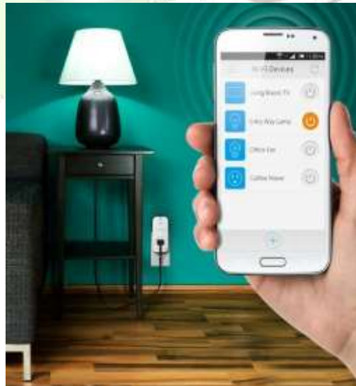
Figure 1 Existing system

It is exploitation Wi-Fi module for home automation. The most four challenges of home automation systems are, high value of possession, inflexibility, poor traceableness, and issue achieving security. the most objectives of existing system is to style and to implement an inexpensive and open supply home automation system that's capable of automating the house appliance through a simple internet interface to run and maintain the house automation system.