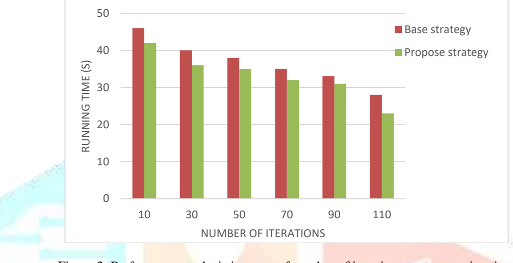
Figure 2: Performance analysis in terms of number of iterations versus running time

clustering algorithm with genetic algorithm is less than FCM clustering algorithm with genetic algorithm.