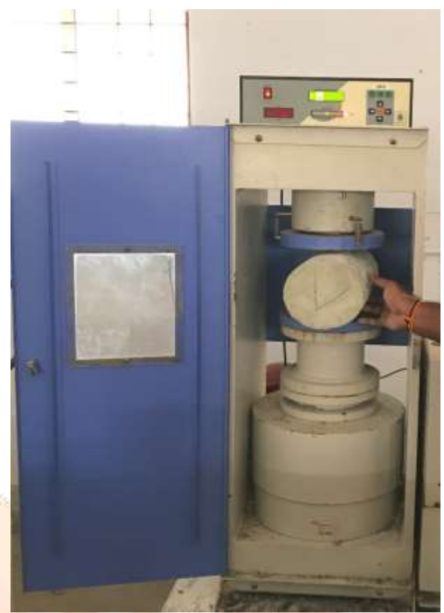
A) Compression Testing Machine