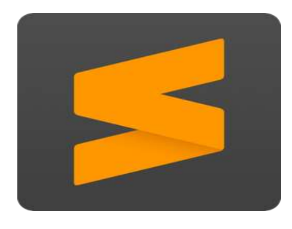
Figure 2.SublimeText 3

Sublime Text is a cross-platform source code editor with a Python application programming interface (API). always natively supports many programming languages, markup languages, functions can be added by users with plugins, typically community-built and maintained under free-software licenses. The list of features in sublime text is "Goto Anything," quick navigation to files, symbols, or lines "Command palette" uses adaptive matching for quick keyboard invocation of arbitrary commands, Simultaneous editing simultaneously make the same interactive changes to multiple selected areas, Python-based plugin API, Project-specific preferences, Extensive customizability via JSON settings files, including project-specific and platform-specific settings, Cross platform (Windows, macOS, and Linux), Compatible with many language grammars from TextMate.