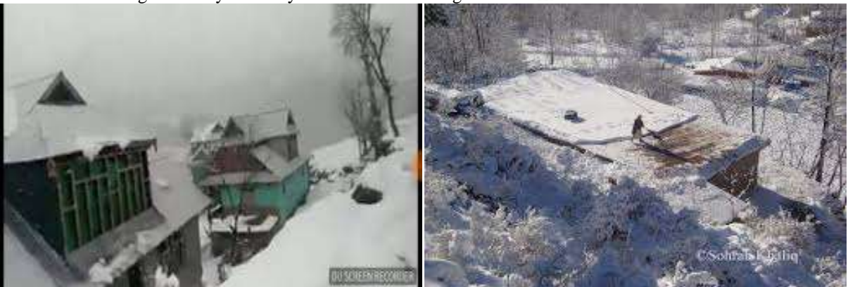
Source: - https://www.google.co.in/search tribal nomadic people areas in Jammu and Kashmir

15. Winter season:- Especially in the state of Jammu and Kashmir Panchayati Raj system the winter season is a great challenge because in winter almost whole Jammu and Kashmir in grip of snow, all developing work is closed maximum people don't leave there house in winter due to the heavy snowfall and cold, either it is a time of election or any other development work. <sup>ibid, [37]</sup> if any work is done through Panchayat in hilly areas it is also damage due to the avalanches and landslide.