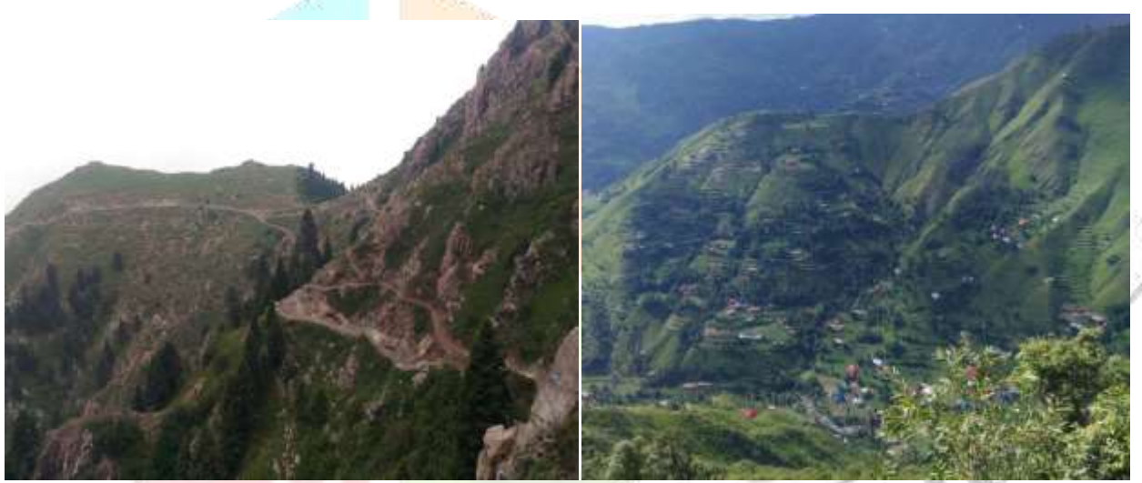
Source: - https://www.google.co.in/search tribal nomadic people areas in Jammu and Kashmir

13. Poor infrastructure of Panchayati Raj system: Infrastructure is another issue of Jammu and Kashmir Panchayati Raj system there is no proper Panchayati building in the village if somewhere is available then the staff of Panchayat is not available there. ibid, [40] 14. Lack of road in hilly areas: In many hilly areas, there is no link road and good transport ways through Panchayati Raj system. Much time it has been analyzed that the polling station is away from hilly areas population and they do not go for casting their vote due to long distance and bad condition of ways. ibid, [35] due to the lack of road and good ways people avoid all activities of the Panchayat. This is also a big challenge of Panchayati raj system.