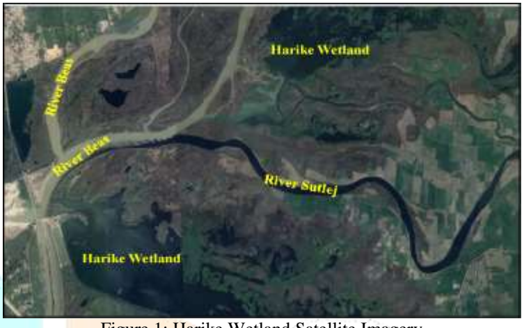
Figure 1: Harike Wetland Satellite Imagery

Harike wetland is a freshwater ecosystem with an international importance. It is the largest man made wetland of North-India that came into existence in 1952. This wetland has diverse ecological conditions and flora & fauna due to both lentic and lotic type of environment (Moza and Mishra, 2008). Harike wetland was declared "Ramsar site" by IUCN (1990) for its importance in Biodiversity. This wetland is situated at meeting point of three districts- Amritsar, Ferozpur and Kapurthala (31°08'30.15 N; 75°03'44.18 N; 210 msl). The main water inflow in the wetland comes from River Beas and Sutlej (Figure 1).