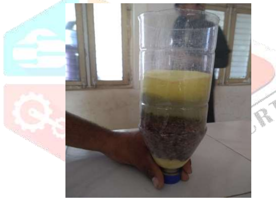
Fig.1: Rice Husk Ash filter bed model