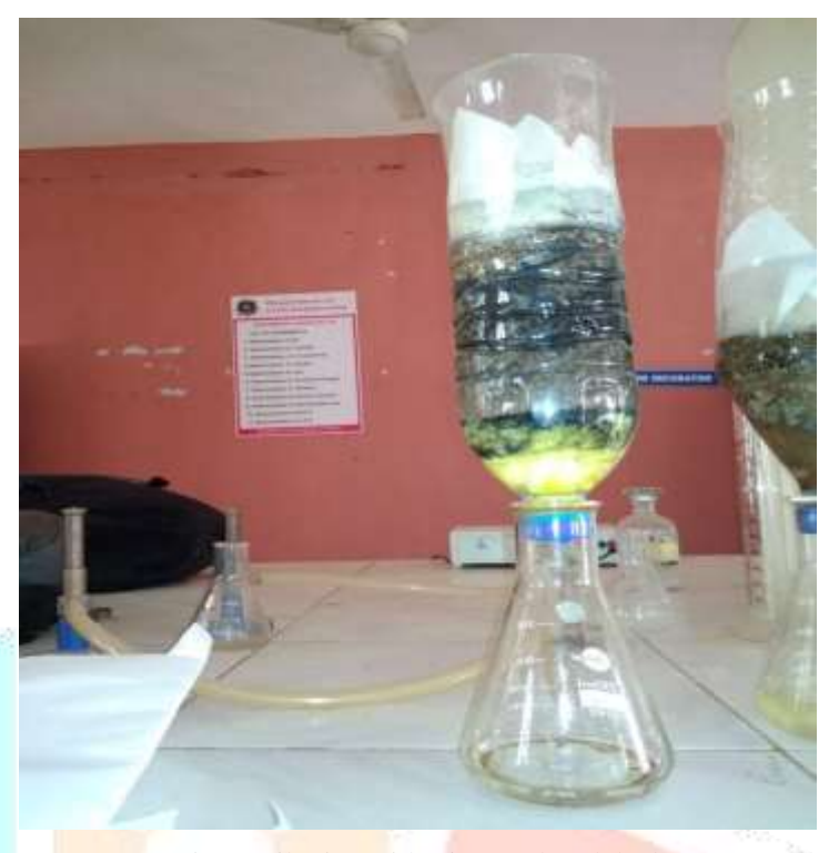
Fig. 4: Filtering with Rice Husk Ash bed

Rice husk ash water filter experimentation plane sand passing through 475Micron retained sand as top layer, 236microns passed sand and235microns retained sand as middle layer and 75microns sand retained as bottom layer IS sieve .Top and bottom layer of sand having different thickness and in between a layer of rice huskash of different amount was placed .The sand and rice husk ash filters the water and collected in a beaker then it is filtered through a Whatman filter paper. And tests are conducted on filtered water to know whether there is a change in water properties . And tests are conducted on filtered water to know whether there is a change in water properties . and differnts like mineral acidity, toatla alkanity, chloride content, nitrates content, phosphates content, dissolved oxygen are conducted and the test results are as follows: