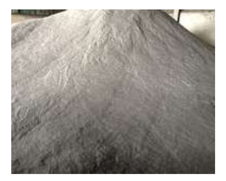
Fig. 3: Rice husk Ash

The stones, ideally little, bolster the channel material and give the accompanying points of interest. Filtration is enhanced as the water needs to take after a convoluted course; The stones avert splitting and contracting of the RHA-concrete filling when it dries.