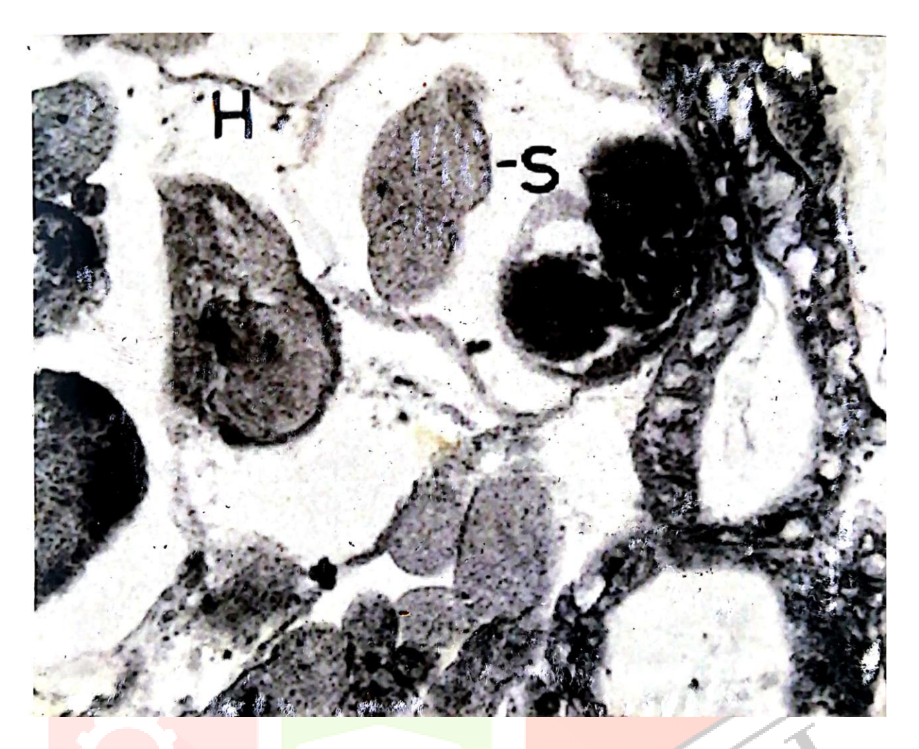
Figure 1.2 Section of hepatopancreas of Lymnea luteola infected with Cercaria

Microcaeca n.sp. showing the presence of reduced amount of acid