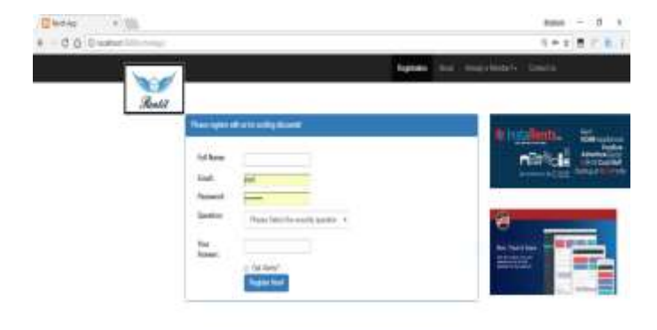
Fig 6.1. Registration layout

JavaScript, for both client-side and server-side coding. Participants will learn how to employ Node.js on Windows, Mac OS or Linux in order to write scalable web servers and applications. Additionally, the Express web framework will be introduced in order to demonstrate how to quickly program traditional webapps and single-page applications (SPA) with the aid of jQuery, AJAX and RESTful web services. The resulting programs will be usable from any modern web browser, including those found in desktop and laptop computers, and mobile devices such as tablets and smart-phones. Participants should have prior working knowledge of client-side (running on a browser) JavaScript and HTML.