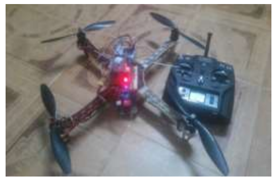
Fig.5Shows the setup of Quadcopter and Raspberry Pi 3.