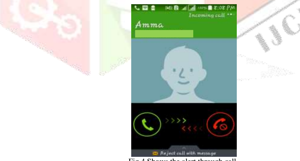
Fig.4 Shows the alert through call.

The Figure-4 shows the alert through call. Configure the Raspberry Pi IP address in mobile phone. Enable the portable Wi-Fi hotspot in mobile. After tethering, give the mobile number in the code to which the alert has to be given. If the gas is sensed, then the alert is given to the registered mobile number via call.