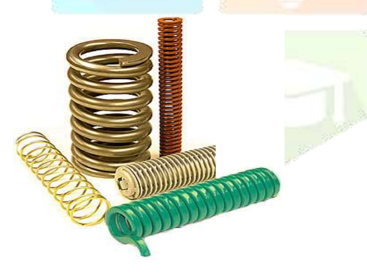
Figure.1 Coil spring