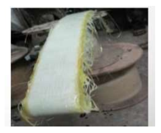
Fig.5 Composite Leaf blade

be suggested for the fabrication of composite leaf spring from unidirectional GERP. Composite leaf spring was fabricated using wet filament winding technique [15]. To assess the tensile behavior of hybrid fibre laminates to justify the overall behavior of hybrid laminates under various loading conditions, two types of laminates (360 GSM woven & 200 GSM chopped) composite specimens were tensile tested. The load-deflection curve was evaluated. It is observed from the results, compare to chopped fibre woven glass fibre/Epoxy composites yields high strength [16]. In the present work, the hand lay-up process was employed. The templates (mould die) were made from wood according to the desired profile which is as shown in figure.4. The glass fibers and silk were cut to the desired lengths, so that they can be deposited on the template layer by layer during fabrication. In the conventional hand lay-up technique, a releasing agent (PVA) was applied uniformly to the mould which had good surface finish. This is followed by the uniform application of epoxy resin over glass fiber. Another layer is layered and epoxy resin is applied and a roller is using for removing all the trapped air. the prepared leaf blade with proper volume fraction of both Glass fibre and silk fibre and limited to experimental dimension of the sample which is as shown in figure.5.