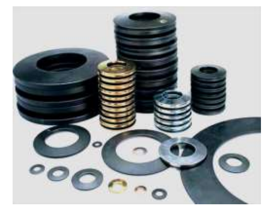
Figure.3 Disc spring