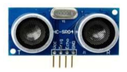
Fig 4.1 HC- SR04

The obstacle detection sensor is used in this project in order to calculate the distance of the obstacle from the wheelchair. The transmitter continuously transmits the ultrasonic waves. When any obstacle comes in the path of the waves, the waves hit the object and are reflected back. The reflected waves are captured by the Receiver. Based on the time elapsed between the transmission and reception of the ultrasonic waves, the distance of the obstacle from the wheelchair is calculated.