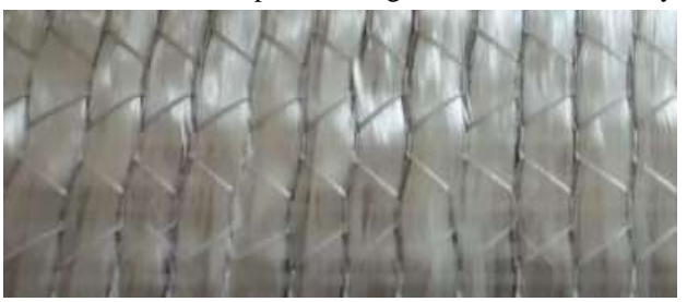
Fig 1. Unidirectional Glass fiber Hybrid Resin

this investigation is Uniwave E-Glass fiber reinforced in hybrid resin matrix contains vinyl ester and PBI. The areal glass fiber weight is 1200 gm./sq. and construction was unidirectional wrap direction glass fiber with three layers that has been shown in fig1.