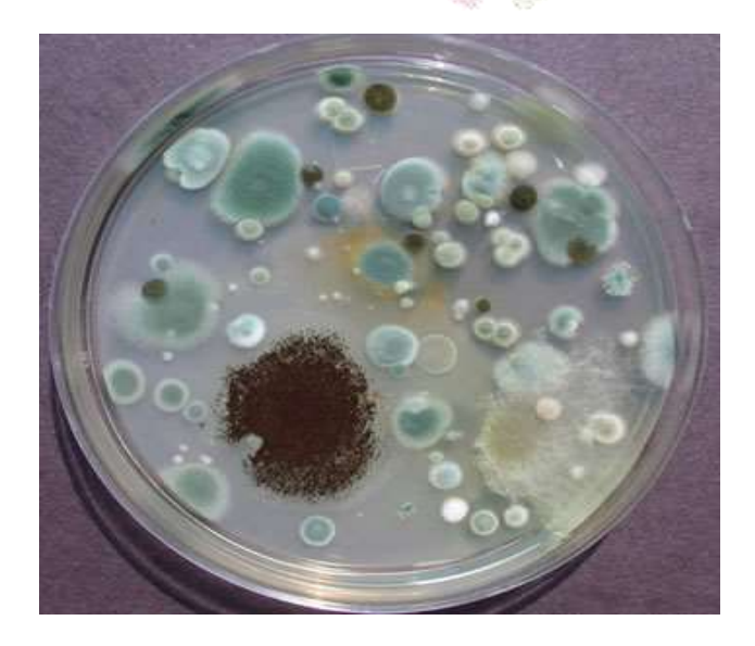
Figure 2. Oligotropic bacteria