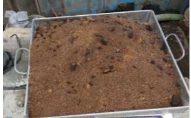
Fig 1. Foundary sand

aggregate by used foundry sand. Replacement of fine aggregate with used foundry sand provides max compression strength at 50% replacement.