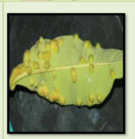
Highly infected leaf