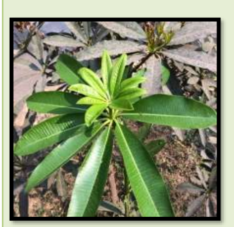
Fresh non infected leaf of Alastonia scholaris

This study on the gall induced by P. tuberculata on A. scholaris contributes to the knowledge about the plasticity of plant tissues stimulated by biotic factors. The gall insect is species specific to the host plant and completes its life cycle around that tree only. The insect takes its nutrition from the tree and if they are in fewer amounts no harm is caused to the tree. But if the infection is increased to a certain level where the leaves gets crumbled and dies then the insects are categorized as pests. Sometimes it is been observed that the insects are preyed by other insect predators. The predator enters the gall through a small opening, eats the gall insect and stays in their galls taking up their nutrition. Thus the presence of gall insects maintains the food chain and the ecological balance for the higher animals. But it is also a matter of concern that if the infestation increases it harms the plant growth and gradually kills the plant therefore if the gall insect is present in a large amount and infecting the plant continuously then it is stated as a pest for that plant and measures should be taken to lower down the number of infections.