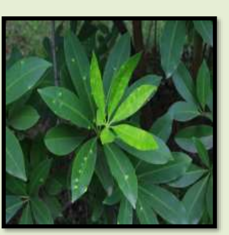
Infected leaf of Alastonia scholaris