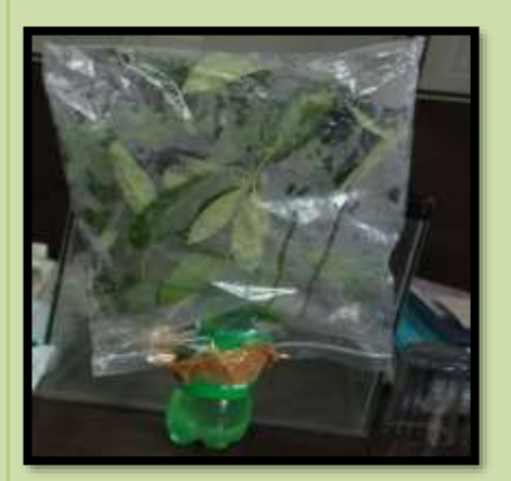
Alastonia scholaris leaves trapped in polybag for trapping of adult P.tuberculata