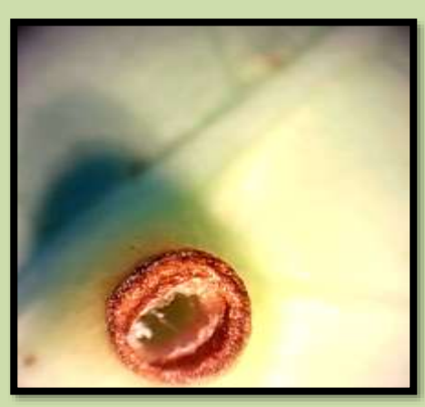
Gall after adult is emerged out