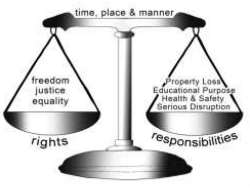
Fig 3.1 Social ethic.

socialization, Negative socialization, Positive socialization, Natural socialization, planned socialization, Language socialization, Oppression socialization, racial socialization, Gender socialization, Group socialization, Organizational socialization etc.