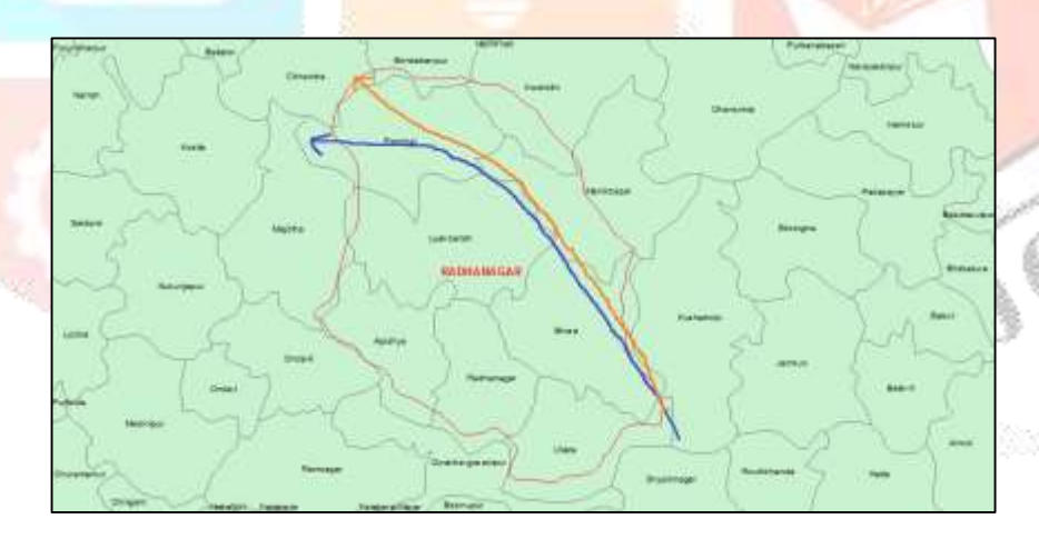
Fig-1. Elephants route through mouzas in different two colours in different two years (blue-2015, orange-2017) in Radhanagar forest range. Sketched from the range office stuff information.

A forest range level survey was carried out. At first a mouza map of Bankura district was prepared. This map was clipped by each forest range by using ArcGIS 10.3 version Software. In this clipped map elephant's movement route is sketched by the information of a particular forest ranger or office stuff. This survey work has been done from all forest range in Bankura district. After completing this all sketched map were mosaiced to prepare a district view map of elephant movement route. This survey was done in two different years (2016-2017) to justify the results.