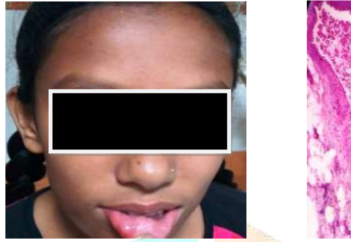
Fig: 1 Clinical picture of Mucocele at lower Right side of lip mucosa.

granulation tissue, which contains spilled mucous. Clinicopathologic features were suggestive of Mucous Extravsstion Cyst.Patient is under review since 60 days and no recurrence is noted.