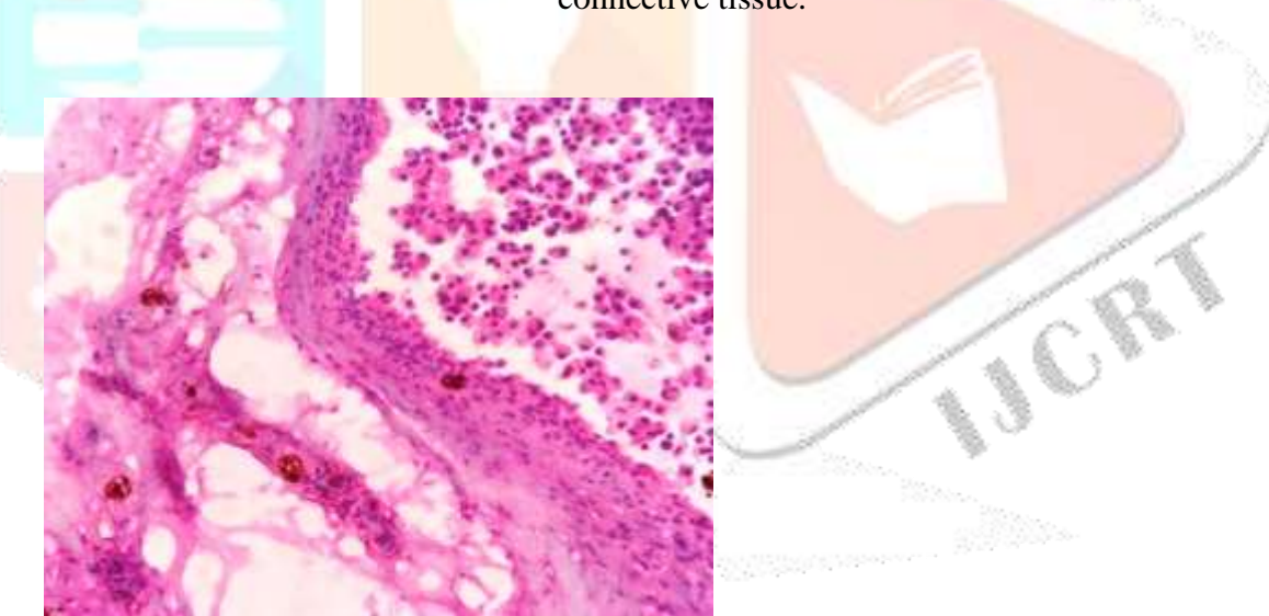
Fig: 3 H& E stain 40x showing parakeratinized Stratified squamous Epithelium and Cystic lumen lined by granulation tissue, which contains spiiled mucous.