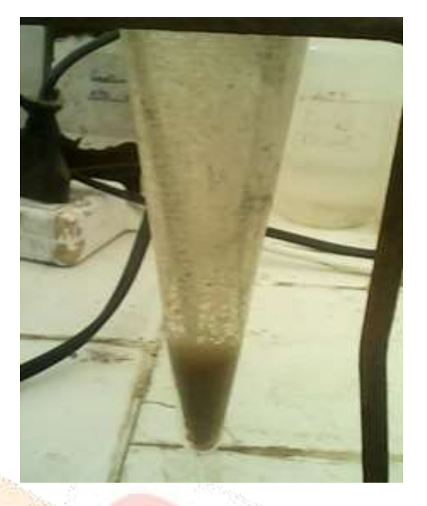
Fig. 4:- Imhoff cones showing floc volume.