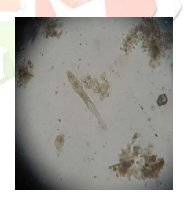
Fig.6 :- Bioflocs with entangled rotifer, diatoms and protozoan