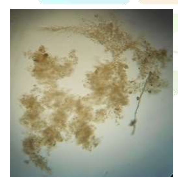
Fig. 5:- Microscopic view of bioflocs showing