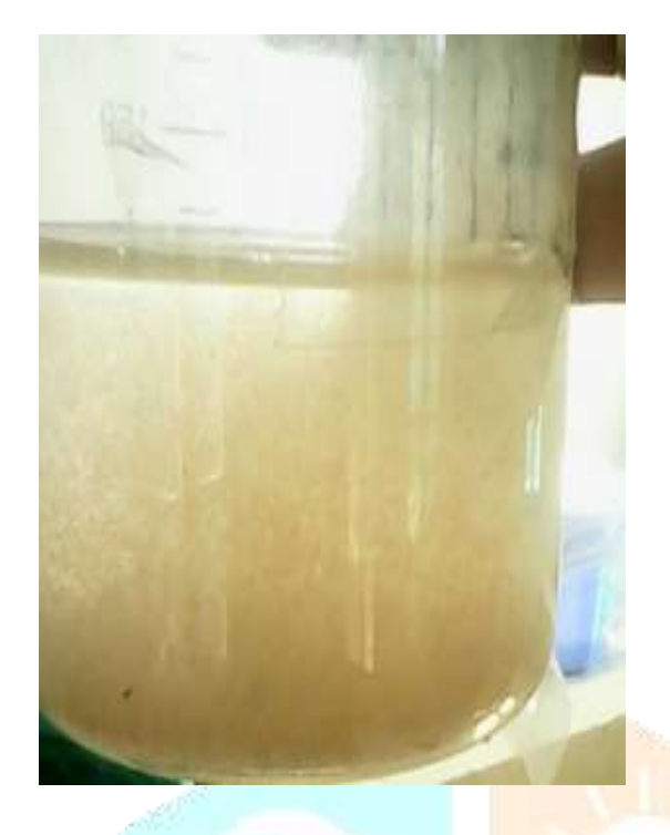
Fig. 3:- Suspended bioflocs in water sample