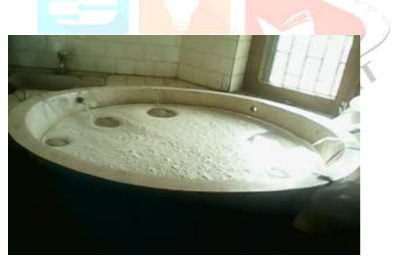
Fig. 2:- Intense froth formation