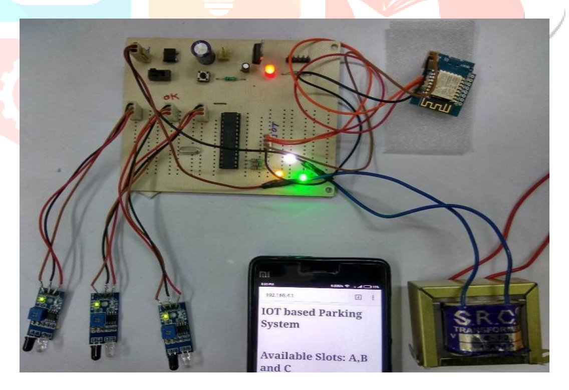
Fig.2. Search available slots in parking area

The project "Automatic Parking system using Internet of Things" was designed such that the status of parking slots can be known from anywhere in the users webpage. This is achieved using Wi-Fi communication. In this system, the user has to be connected to the Wi-Fi network of that particular parking area through which he is given access to the webpage and can know about the status of the parking slot.